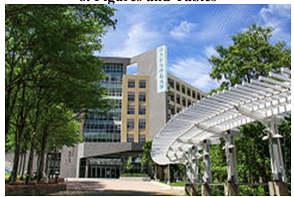
Fig. 1 The 40<sup>th</sup> National Conference on Mechanical Engineering of CSME will be held in Changhua City on December 1, 2, 2023.

Table 1 Important dates for the 40<sup>th</sup> National Conference on Mechanical Engineering of CSME.